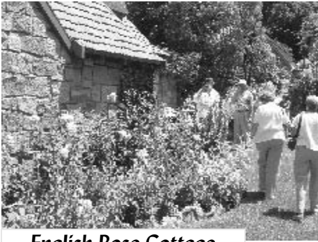
English Rose Cottage