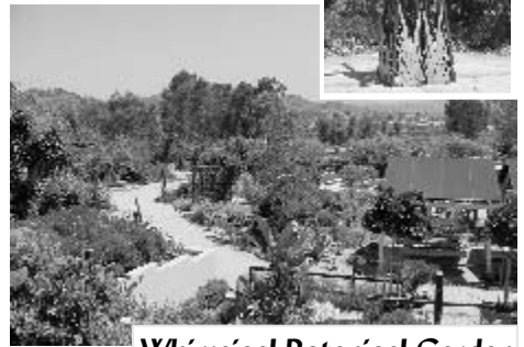
Whimsical Botanical Garden