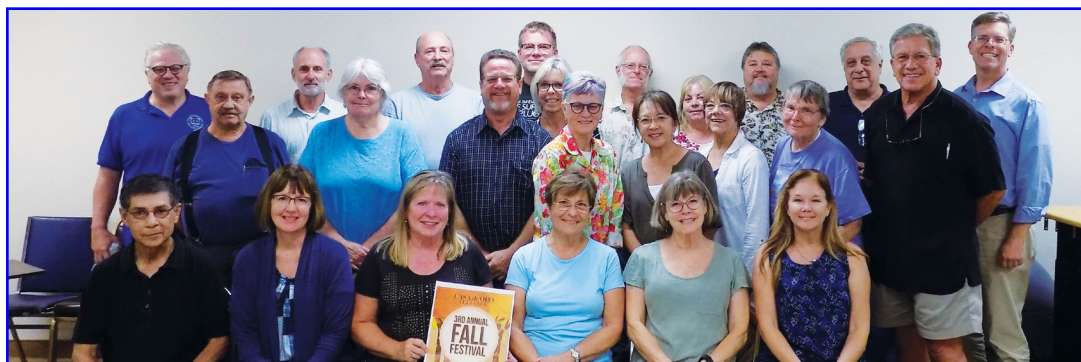
Casa de Oro Alliance

Project Wildlife services also include free educational outreach. For more information, check out www.projectwildlife.org . 🌱