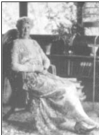
Carrie Jacobs-Bond (left) Ernestine Schumann-Heink (right)

All GMIA members should plan to attend this Annual Membership Dinner Meeting. In fact, every member should invite and sponsor a non-member neighbor as a way of introducing them to your GMIA community improvement association! Watch your mail for a special flyer providing more details on this event along with the reservation form. ■