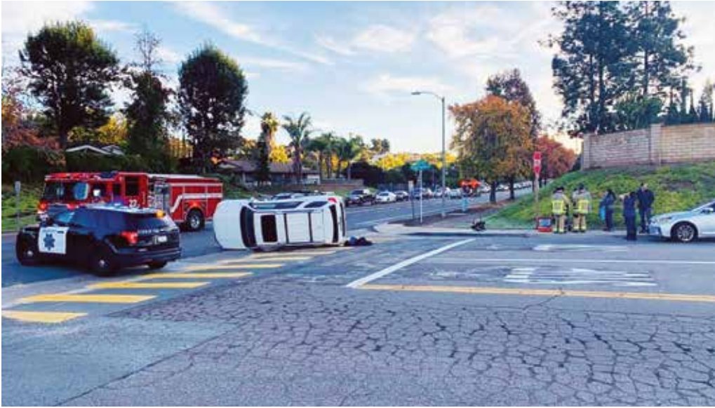
Fury Lane and Calle Verde vehicle accident