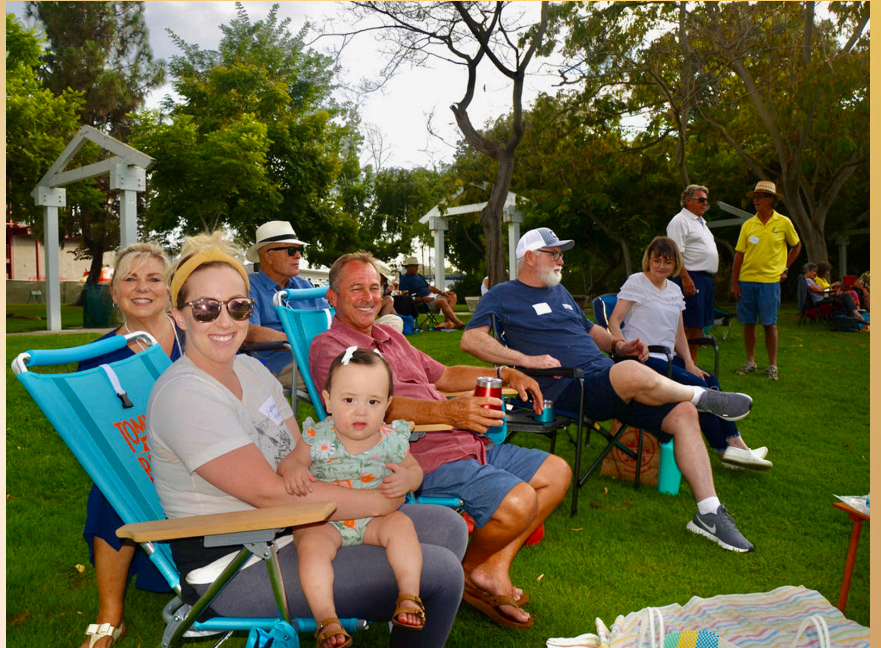
Families enjoying the GMIA picnic