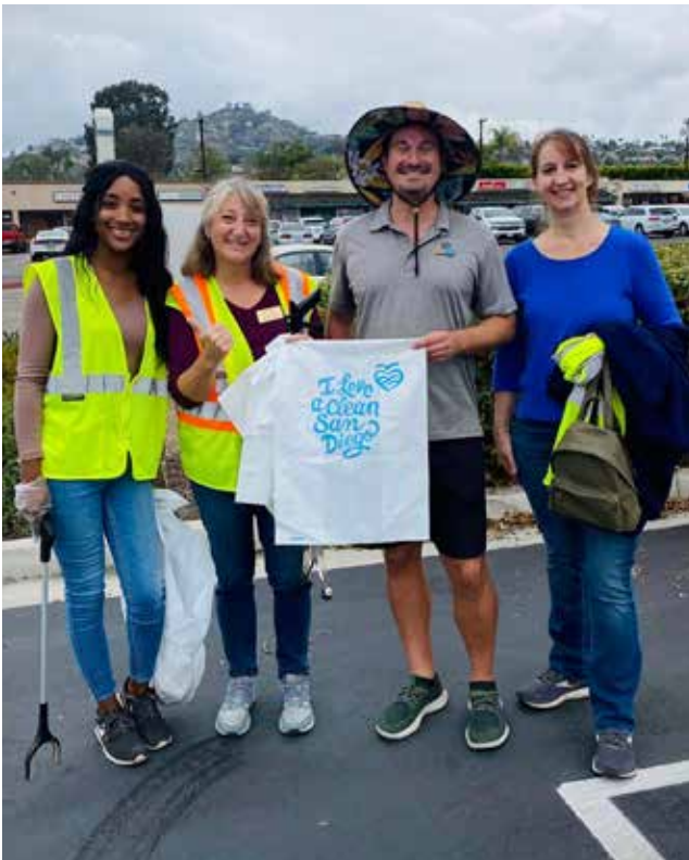
In October, the Alliance partnered with I Love a Clean San Diego to clean up San Juan Street and Kenora Drive.

The Alliance is looking forward to participating in the 2023 GMIA Walk to the Top event. Be sure to stop by our table and introduce yourself. As a 6+ year member of GMIA myself, I'm looking forward to seeing you there! And if you have any questions or comments for us, please contact PresidentCDOA@gmail.com 📧